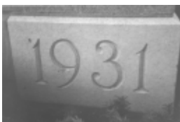
Jamesburg High School Cornerstone